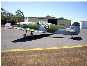
Pat's mates plane ready to fly