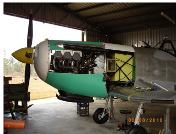
350 HP Lycoming T10 540 engine