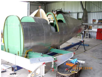
The start of the project

The photos below show different stages of the build.