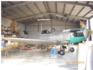
Almost ready to go to the painters